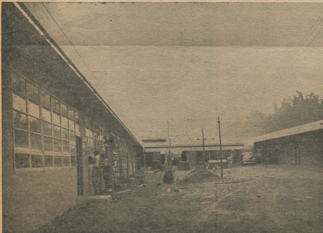
Workmen are busy putting on the finishing touches on the classroom buildings so they will be ready for completion November 2.

Federal Survey cards, which were passed out in your first period class today, are to be returned Monday. In the midst of our moving to a new location this is just a reminder to be sure and bring them. The cards are to be filled out completely and signed by your parents. Your promptness in returning the cards is important since it will help the school greatly.