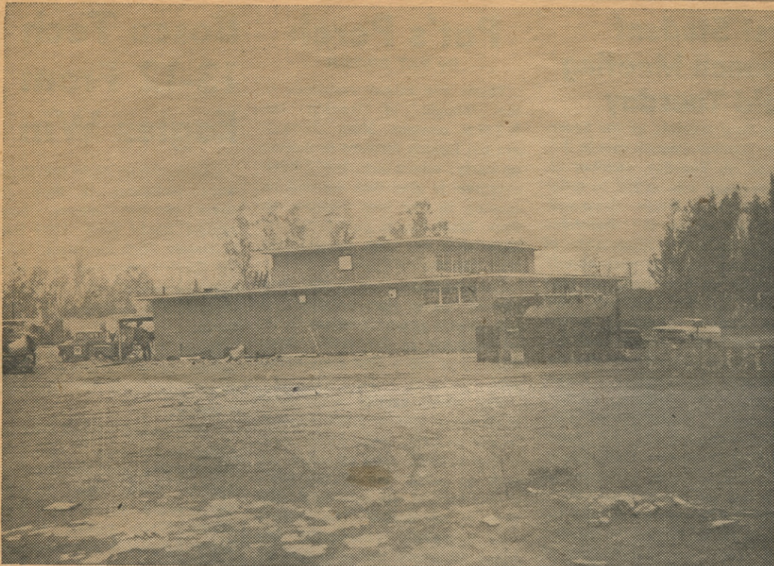
the girls' shower and locker room is very near to completion when this picture was taken. Lockers are to be installed November 2 and 3.