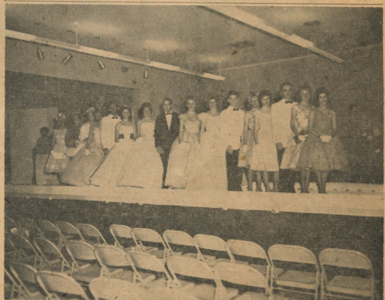
"THE LOOK OF SPRING" was presented by the Harris Co. Feb. 24. Pictured above is the new spring attire modeled by Eisenhower students.

The fashion show which was held was a big success. Special awards were pre-