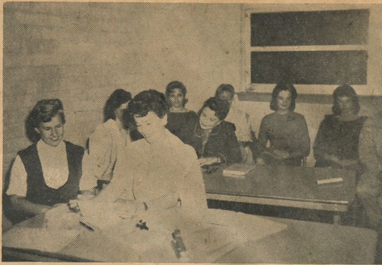
HOPEFUL STUDENTS ANSWER QUESTIONS AS THE STUDENT PLACEMENT REPRESENTATIVE GOES OVER NECESSARY INFORMATION FOR EMPLOYMENT.

Remember, Eagles, Easter is fun if . . .