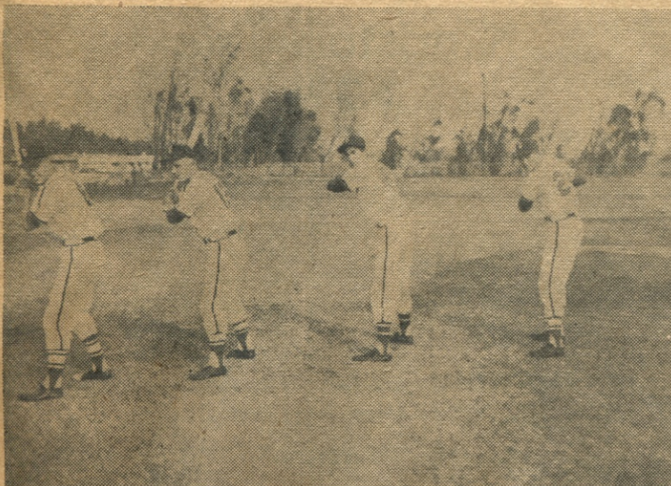
EHS Varsity Baseball Team warms up before the Big Game Tuesday.

736 Third Street San Bernardino TU 43-4163