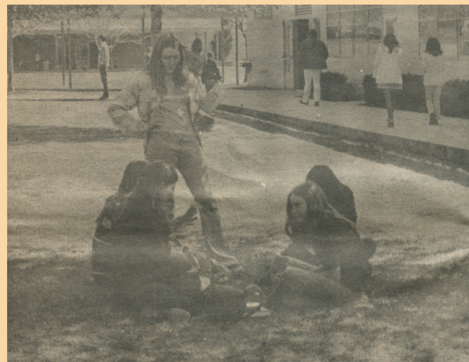
STUDENTS ENJOY the relaxed casual atmosphere of open campus.